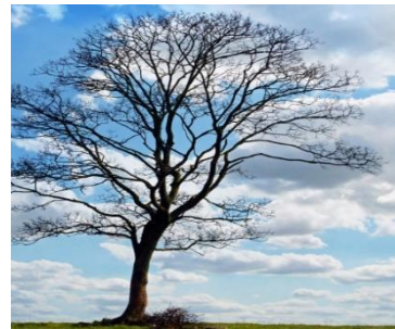
A tree with no leaves