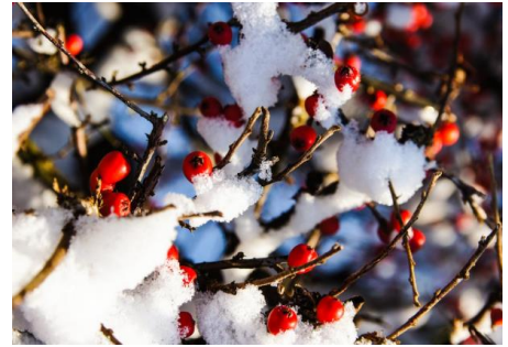
Berries on a tree or bush