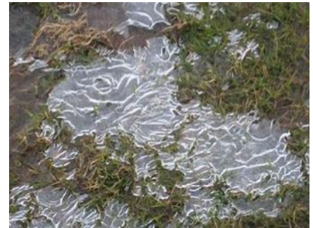
A frozen puddle