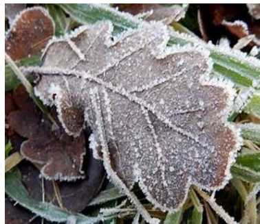
A frosty leaf