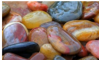
An interesting stone (Think texture and shape)