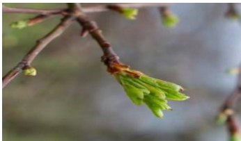
Signs of spring (bud)